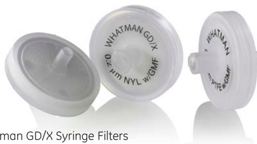
Whatman GD/X Syringe Filters

The Whatman GD/X range is specifically designed for high particulate-loaded samples. Constructed of a pigment-free polypropylene housing with a prefiltration stack of Whatman GMF 150 (graded density) and GF/F glass microfiber media, these filters allow you to filter even the most difficult samples with less hand pressure. Whatman GD/X Syringe Filters can process three to seven times more sample volume than a syringe filter containing a single filtration layer.