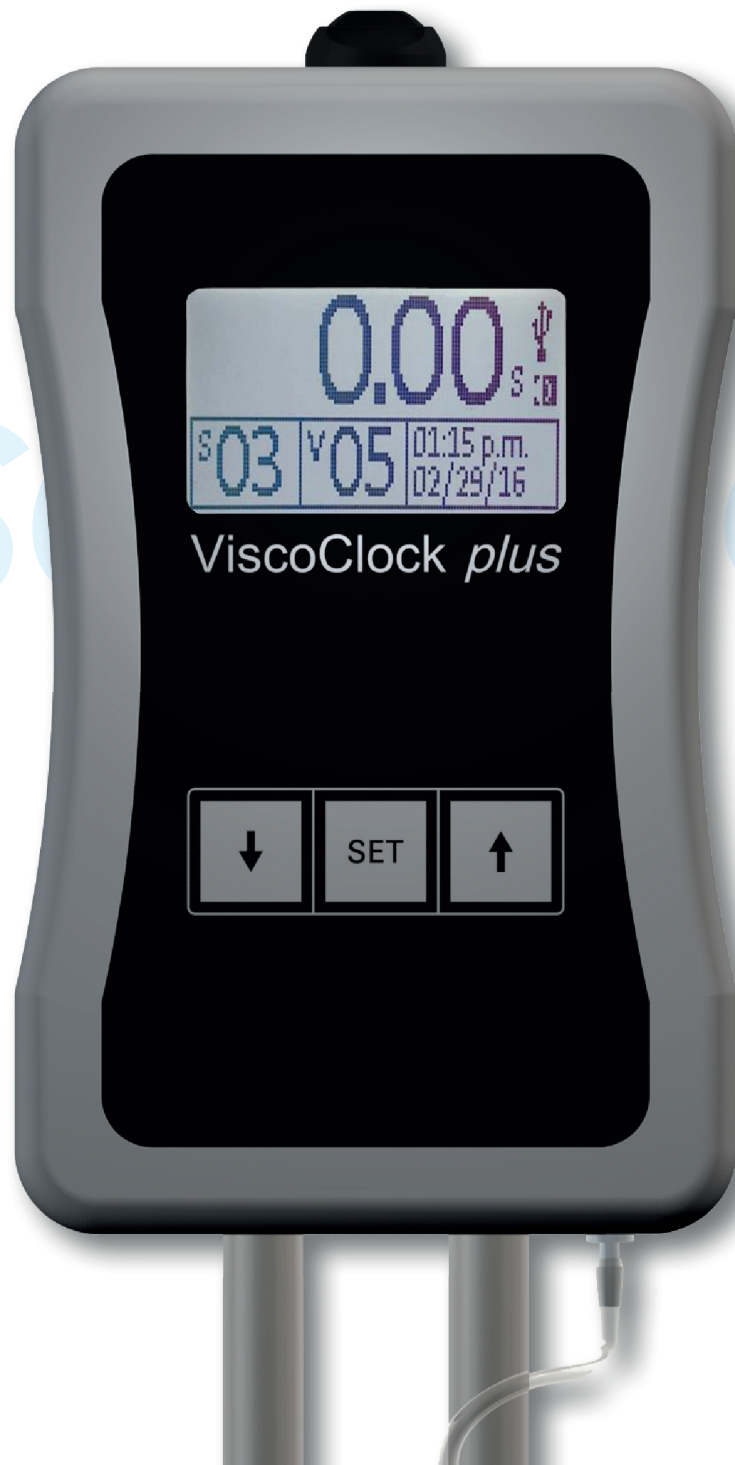
ViscoClock plus - head

The viscometer including a sample is inserted into the ViscoClock plus and immersed into a thermostatic bath for temperature stabilization. After thermostating, the sample is pumped into the measuring bulb, and the flow time is detected automatically. The large display enables easy read-off of flow times and additional information: date, time, sample ID and viscometer ID.