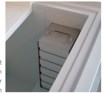
Inner lids (left hand side) which are mandatory for optimized function