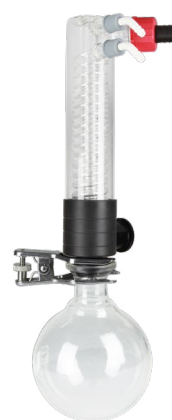
Exhaust vapor condenser (EK) (20751801)