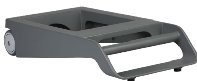
VACUU·PURE shuttle (20751800)