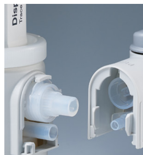
Valve system designed without seals