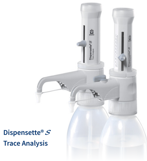
Dispensette® S Trace Analysis