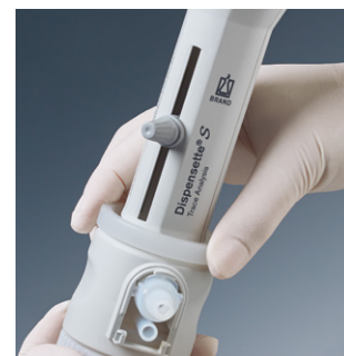
Easy replacement of the complete dispensing unit without tools – dispensing unit is fully adjusted.