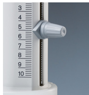
Positive volume setting using interior scalloped track