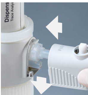
Simple-to-mount discharge tube

The above recommendations reflect testing completed prior to publication. Always follow instructions in the operating manual of the instrument as well as the reagent manufacturer's specifications. Should you require information on chemicals not listed, please feel free to contact BRAND. Status as of: 0815/2