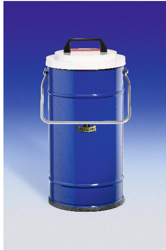
Dewar flasks 30/4 to 32 C with handle