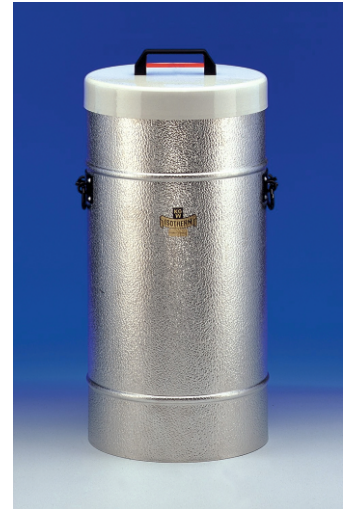
Dewar flasks 33 to 34 CAL with side grips