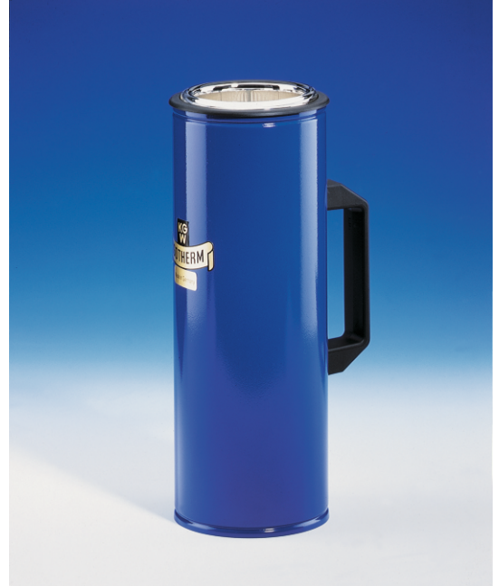
Dewar flask G 9 C