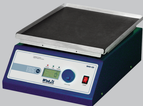
SHO-1D with optional rubber mat platform