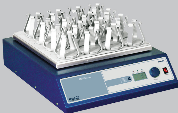
SHO-2D with optional universal platform and flask holder