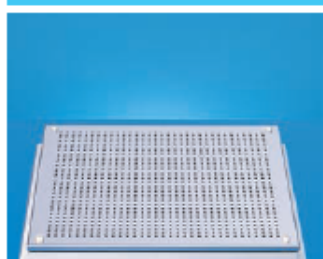
Order No. 3966

Universal mount for secure attachment of different shaking objects between the six rubber- coated bars