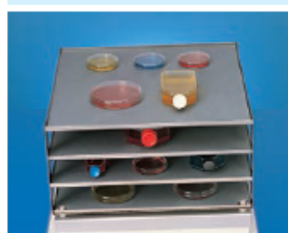
Order No. 3968

Shaking tray made of stainless steel, 450 x 450 mm, with holes to accommodate clamps for Erlenmeyer flasks and other accessory equipment