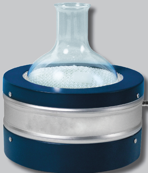
1.000 ml flask heating mantle