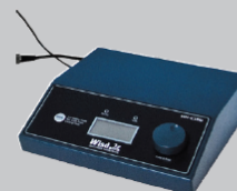
WHM-C10D digital controller