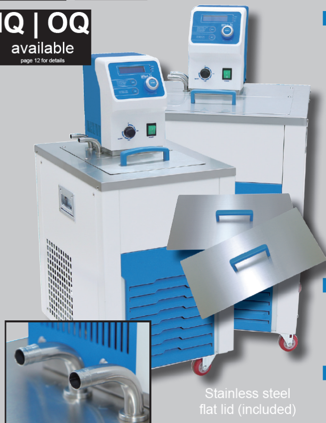
Stainless steel flat lid (included)

Connection for external circulation Ø12.5mm